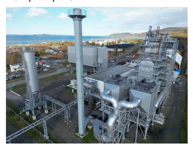
(3rd power plant)