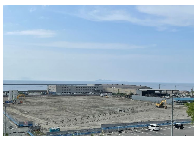
(Current view of the construction site)