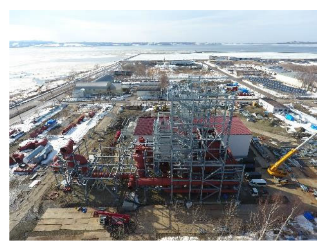
(Bird View of the Plants Site)