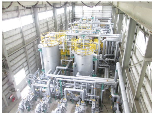
Crude oil processing facility