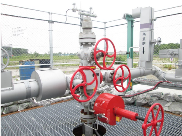
Production equipment of wellheads