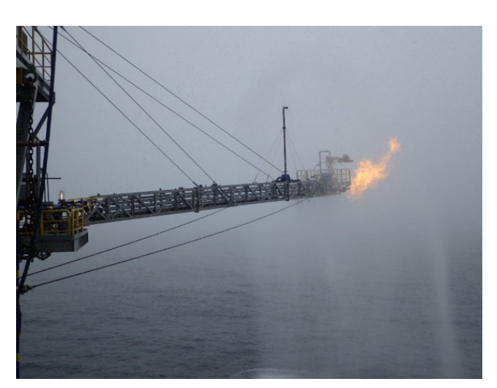
Production test of natural gas