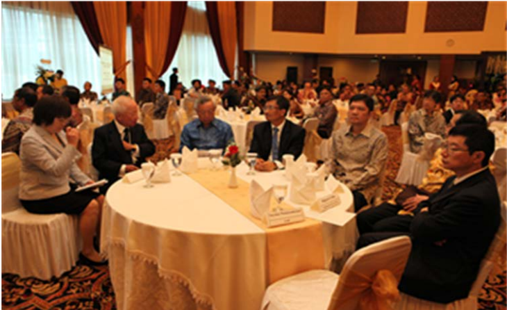
Some 215 VIPs attended the commemoration ceremony